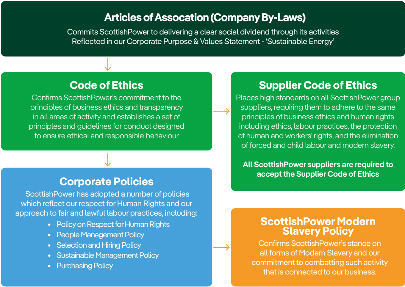
Figure 1: ScottishPower Policy Framework 2024 – note, this Policy framework was amended in March 2025