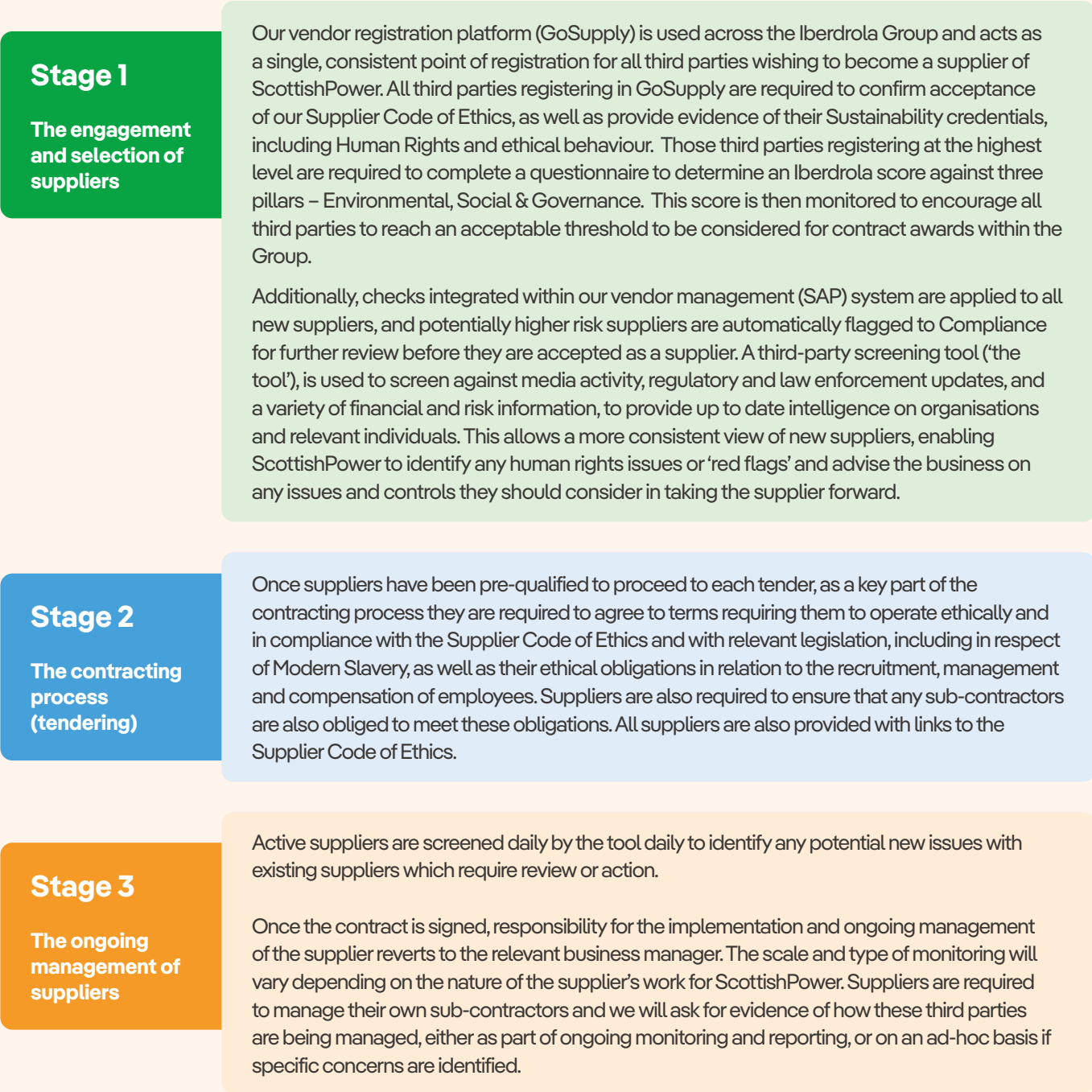
Figure 2: Key steps in the procurement process:

Our standard contract terms for the purchase of equipment, material, works and services, include specific supplier corporate social responsibility clauses which are based on the UN Universal Declaration of Human Rights, the conventions of the International Labour Organisation, the principles of the Global Compact, and compliance with the Code of Ethics. For fuels, the company aims to include these clauses as new contracts are signed. During the term of the contract, the supplier must allow ScottishPower to assess its compliance with the principles established in the contracts where it considers it appropriate, with termination rights for ScottishPower in the event that non-compliance is detected and corrective plans are not adopted. All major suppliers of general goods and equipment and services are assessed on this basis, taking into account their material risks in relation to human rights and potential negative social impacts. These risks are mitigated and managed through the quality processes in place and the regular audits carried out by each business unit. In 2024, Iberdrola continued its campaign of social audits of key suppliers, targeting a further 36 key suppliers. At year-end, 28 social and sustainability audits had been carried out, with the remainder in progress. The results of these two campaigns were positive, as the independent auditors were able to verify “in situ” good practices previously declared by suppliers, with minimal deviations..